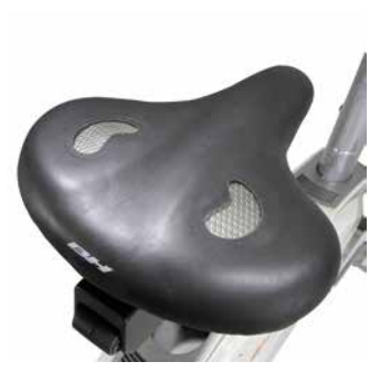
XXL SADDLE Comfortable and adaptable to any user.

LCD display with 12 programs and 24 intensity levels.